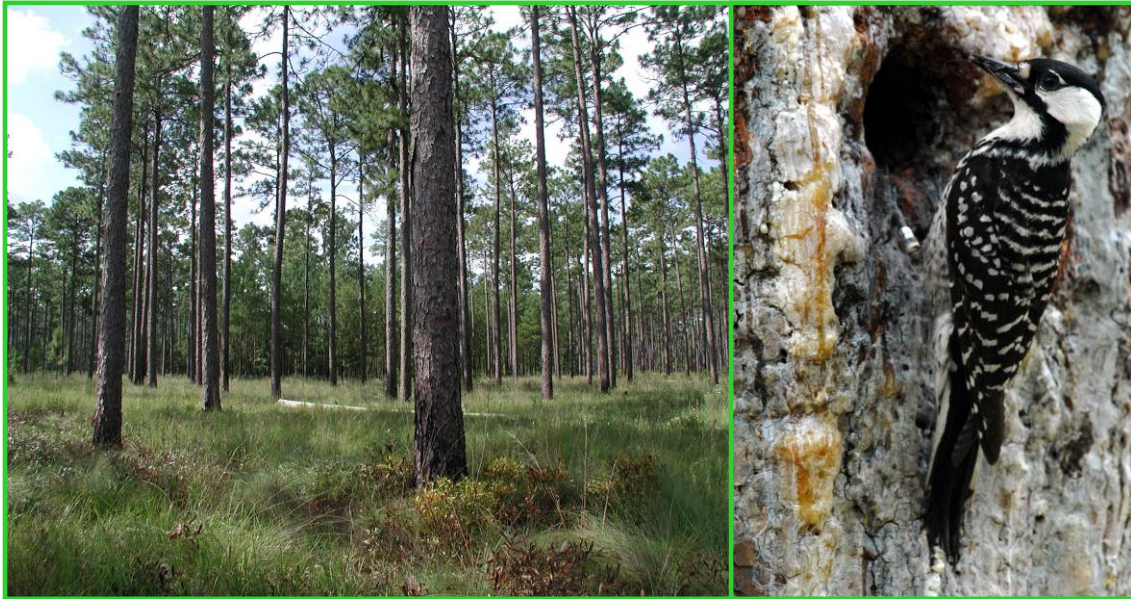
Brosnan Forest protects long leaf pine stands (on left) – important habitat for the Red-cockaded Woodpecker (on right).

Brosnan Forest is rich habitat for Red-cockaded Woodpeckers because of Norfolk Southern’s long-term management of the forest for quail hunting. To manage the forests for wildlife, Norfolk Southern has been enhancing the habitat through a combination of selective thinning of mature timber and controlled burning of the herbaceous vegetation for 50 years. Hunting leases are operating on about 300 acres of Brosnan Forest and bring in about $3,600 per year. Norfolk Southern also sustainably manages timber on all of the property and recently had the property certified under the Sustainable Forestry Initiative (SFI) program.